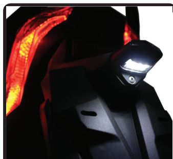
LICENSE PLATE LAMP