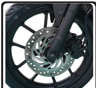
DOUBLE DISK BRAKE