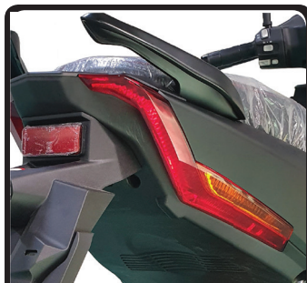
REAR COMB. LAMP